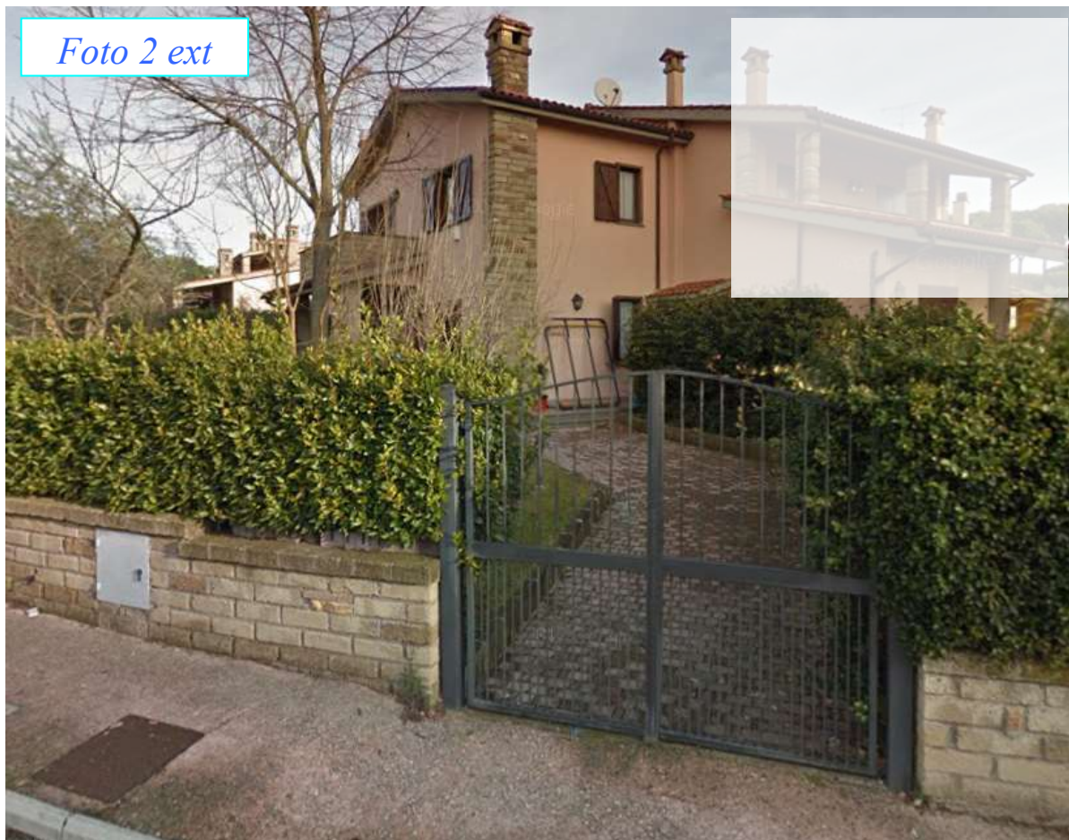
Foto 2 ext