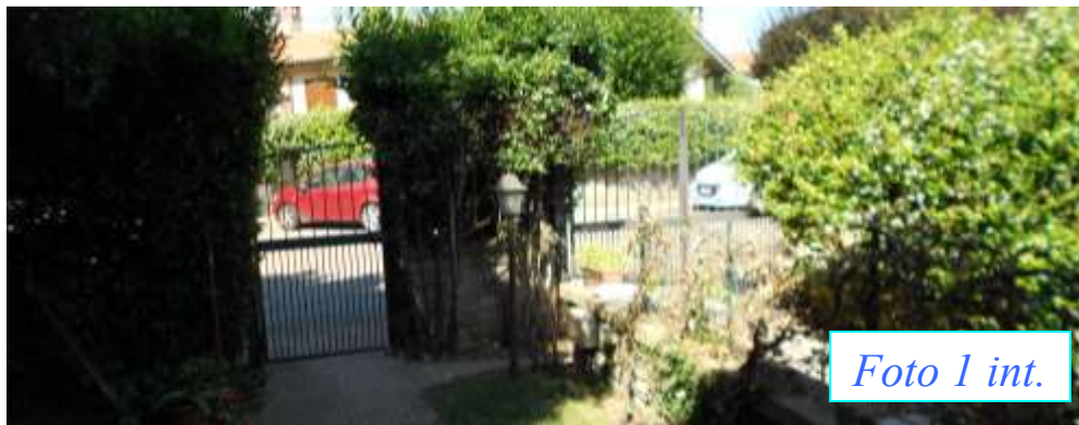
Foto 1 int.