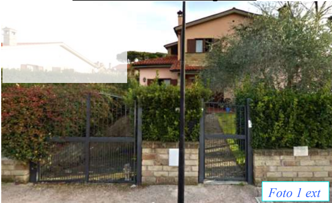
Foto 1 ext