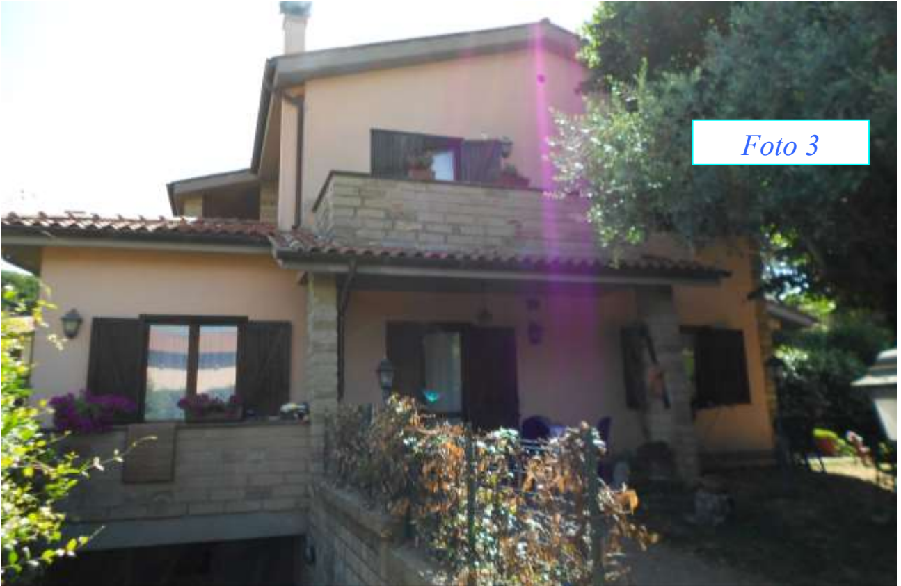
Foto 3 bis